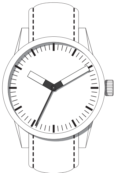
44MM 1.70 INCHES